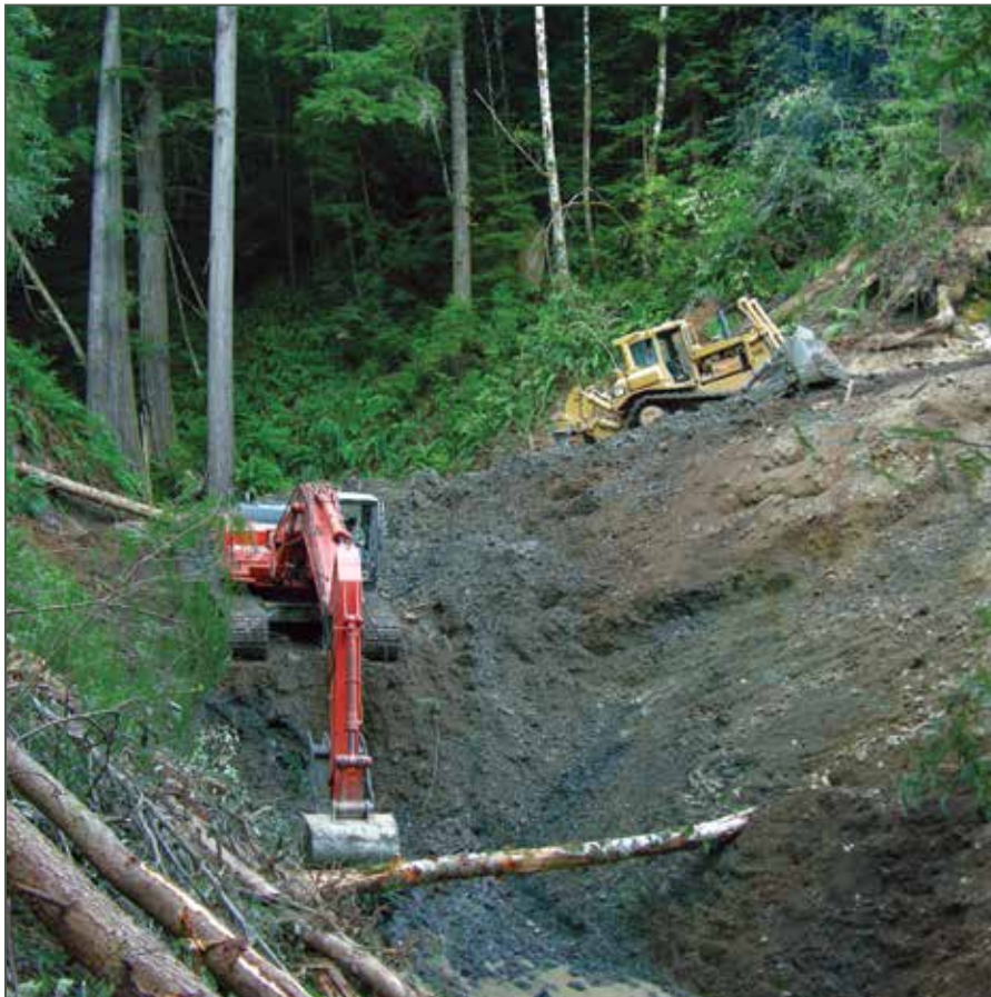
Workers use heavy equipment to remove dirt dumped into a stream in the logging era.

A NEW BEGINNING — California State Parks, with the help of partners, raised $60 million to buy the watershed; they have raised several million more to help restore and repair degraded resources. The partners include Save the Redwoods League, the U.S. Fish and Wildlife Service, California's Coastal Conservancy, the Department of Fish and Wildlife, the Wildlife Conservation Board, and the Smith River Alliance.