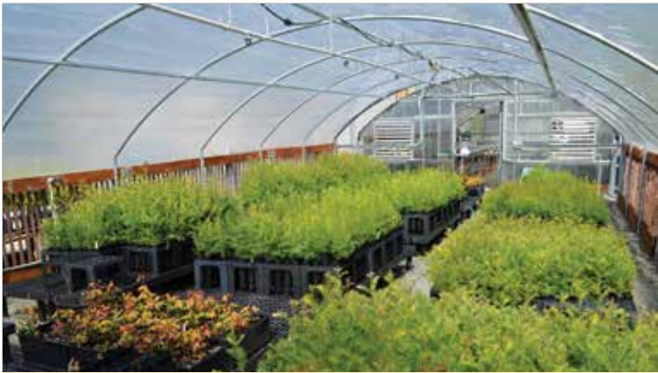
Native plants for Mill Creek and other restoration projects grow in an on-site greenhouse.

RESULTS— By 2015, the restoration team had thinned 4,000 acres of forest, placed 1,000 logs back in streams, and removed 70 miles of crumbling roads with 330 stream crossings. Forests once choked with scrawny Douglas-fir host redwoods, grand fir, and many other native species. Now more salmon are spawning, and the team continues to monitor fish populations, tree growth, and tree spacing and planting options.