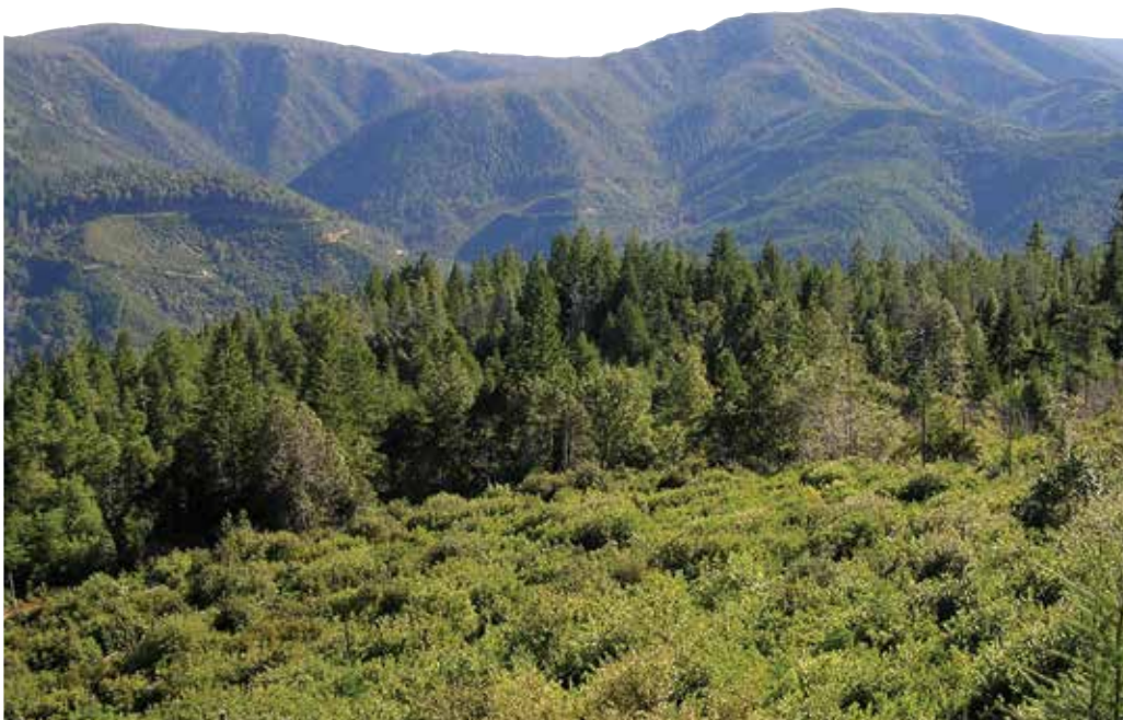
Some of Mill Creek Watershed's old logging roads and clearcuts from the 1980s and '90s.

With the help of scientists, State Parks began experimenting with different treatment options. In “control areas,” they did nothing. In other areas, they cut down Douglas-fir to make room for the redwood and other species, aiming to reduce tree densities to 75 to 250 trees per acre. Where more sunlight could reach the forest floor, young redwoods flourished with less competition, and a more diverse mix of other plants appeared.